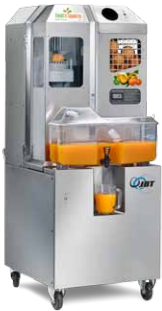
Stainless Steel Model

JBT extractors currently process over 75% of citrus juices produced worldwide.